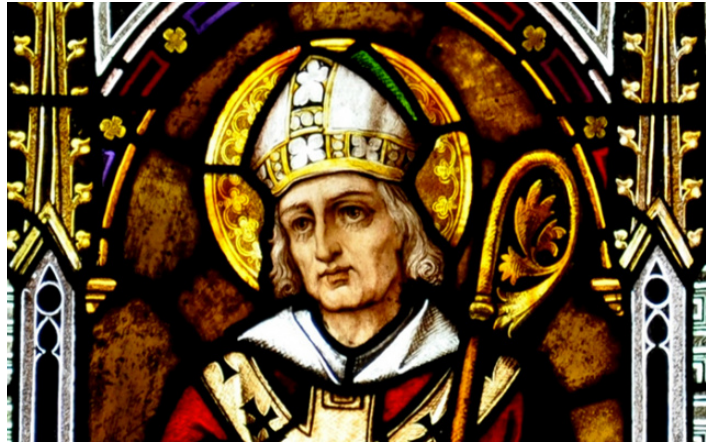
Image (left): Stained glass window of Saint Paulinus

He and his wife then moved to Nola, near Naples. He had a great love for Saint Felix of Nola, and spent much effort in promoting devotion to this saint. Paulinus gave away most of his remaining property—to the consternation of his relatives—and continued his work for the poor.