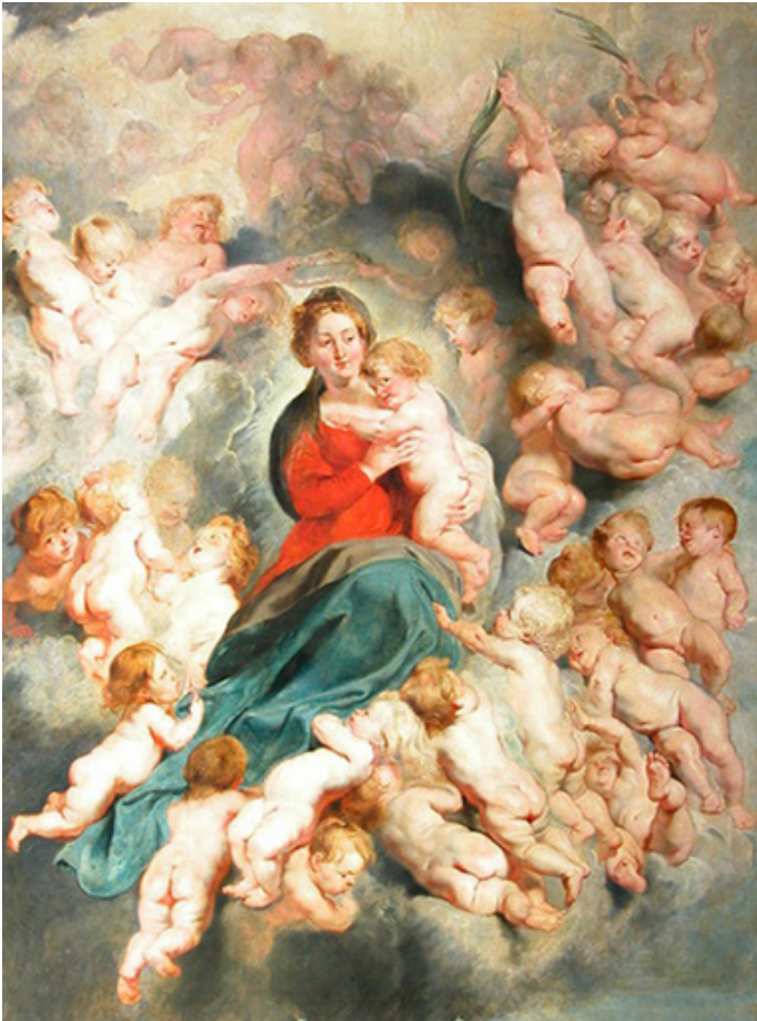
The Virgin and Child Surrounded by the Holy Innocents - by Peter Paul Rubens, Louvre

King Herod was a Roman-appointed King of Judea at the time of Jesus' birth. Interestingly, King Herod was not really Jewish, but rather Idumean, a descendent of people who were forcibly made Jewish by a high priest and ruler named John Hyrcanus. The New Testament tells us that King Herod was a tyrant. Despite his great power over Judea, the news of the birth of Jesus and the fact that wise men came from the East to worship the One "born king of the Jews", made Herod insecure and fearful for his own throne.