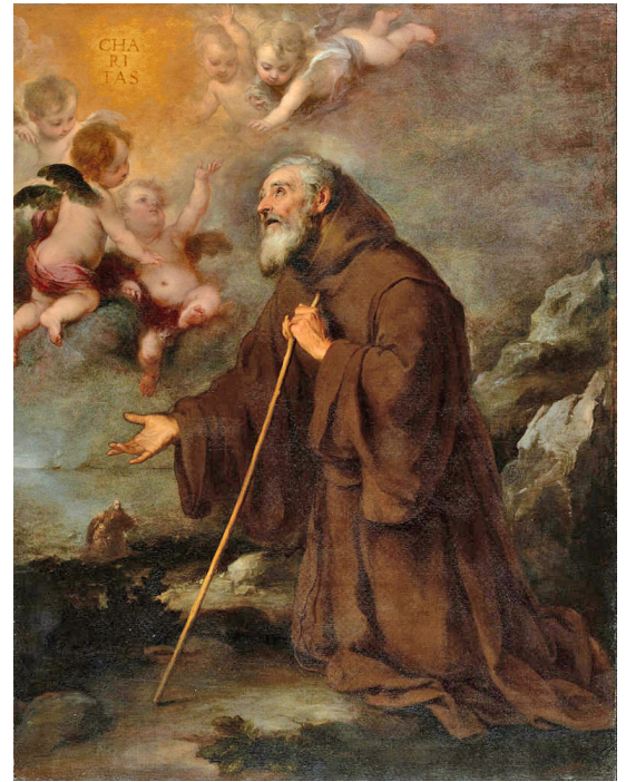
Image of The Vision of Saint Francis of Paola by Bartolomé Esteban Murillo, circa 1670.

It was Francis’s desire to be a contemplative hermit, yet he believed that God was calling him to the apostolic life. He began to use the gifts he had received, such as the gifts of miracles and prophecy, to minister to the people of God. A defender of the poor and oppressed, Francis incurred the wrath of King Ferdinand of Naples for the admonitions he directed toward the king and his sons.