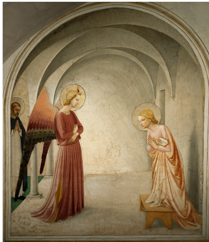
THE ANNUNCIATION BY GIOTTO DI BONDONE

And the Word became Flesh, and it dwelt among us. (John 1:14)