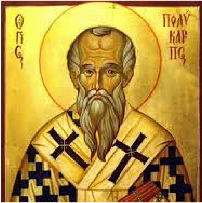
Icon of Saint Polycarp

St. Polycarp was one of the most famous of the little group of early bishops known as "the Apostolic Fathers", who, being the immediate disciples of the apostles, received instruction directly from them, as it were from the fountainhead. Polycarp was a disciple of St. John the Evangelist and was respected by the faithful as a teacher and leader.