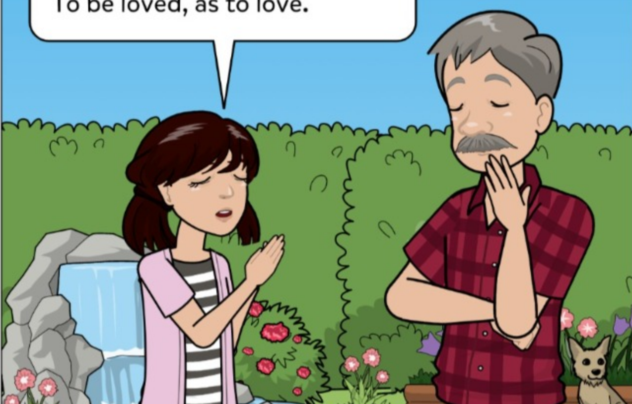
PRAYER OF SAINT FRANCIS

O Divine Master, grant that I may not so much seek to be consoled, as to console. To be understood, as to understand. To be loved, as to love.