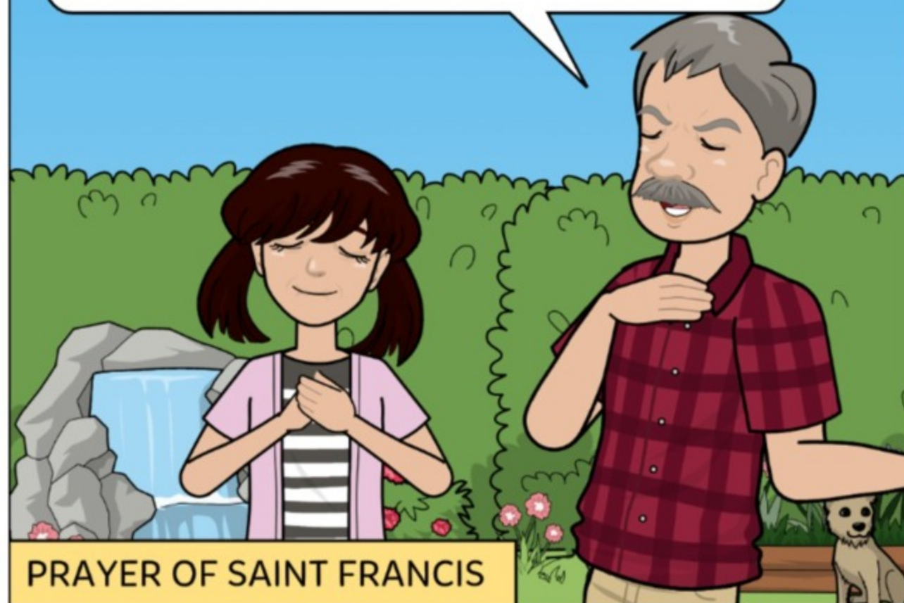
PRAYER OF SAINT FRANCIS

Lord, make me an instrument of your peace. Where there is hatred, let me sow love. Where there is injury, pardon. Where there is doubt, faith. Where there is despair, hope. Where there is darkness, light. And where there is sadness, joy.