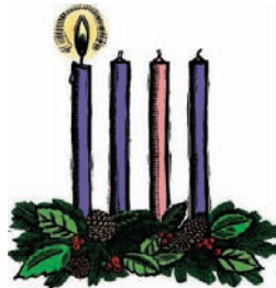
First Sunday in Advent

The blessing of the Advent Wreath marking the beginning of the liturgical season of Advent will take place next Saturday, December 2 at the 5:00 p.m. Mass. Advent has a two-fold nature: it prepares us for Christmas when we celebrate Christ’s first coming among us, and it is a time when we look forward to His second coming at the end of the ages. Advent is a season of joyful expectation. The growing light of the wreath, as the season progresses, signifies that Jesus whose birth we are commemorating, is the Light of the World.