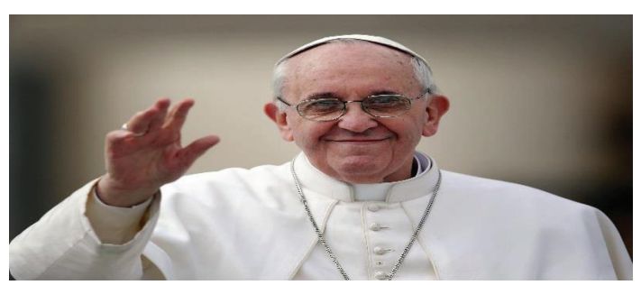
For the abolition of torture ~ We pray that the international community may commit in a concrete way to ensuring the abolition of torture and guarantee support to victims and their families

Parishioners are encouraged to remember the Holy Father's intention in their daily prayers.