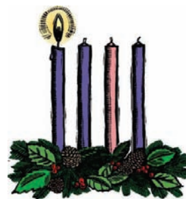
First Sunday in Advent

The blessing of the Advent Wreath marking the beginning of the liturgical season of Advent will take place next Saturday, November 26 at the 5:00 p.m. Mass. Advent has a two-fold nature: it prepares us for Christmas when we celebrate Christ’s first coming among us, and it is a time when we look forward to His second coming at the end of the ages. Advent is a season of joyful expectation. The growing light of the wreath, as the season progresses, signifies that Jesus whose birth we are commemorating, is the Light of the World.